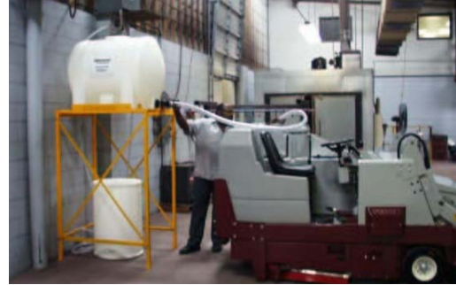
PowerBoss RapidFill 40 Dispensing Station

Sell the System: It only makes sense that PowerBoss equipment should use a cleaning product designed for use with the machine. That means PowerBoss branded products!