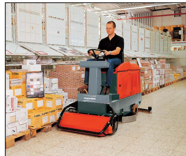
With pre-sweep and tool: Pre-sweeping and scrubbing in one operation, additional scrubbing and vacuuming tool for edges and corners.